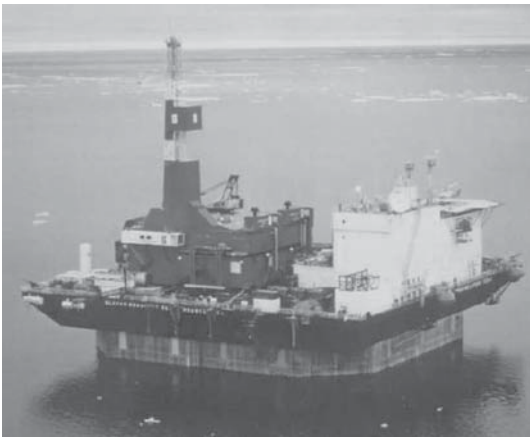
Fig. 3. Concrete Island Drilling System (CIDS) platform constructed with precast and prestressed concrete elements designed to withstand the severe ice-floe pressures of the Arctic. The CIDS platform replaces the building of gravel islands, which cost approximately $100 million to construct, whether oil was found or not. In contrast, the Concrete Island Drilling System cost only $75 million to construct and has been reused for the past 20 years to explore numerous locations along the north Alaskan coastline in the Beaufort Sea without showing any deterioration in the hull. In addition, it leaves no footprint on the seabed. The CIDS is presently operating along the east coast of Russia.

inertial advantage. Long-term durability of concrete construction in an ocean environment has been proven by actual service of existing prestressed precast concrete platforms over the last several decades.